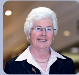
Mayor of Doncaster Ros Jones